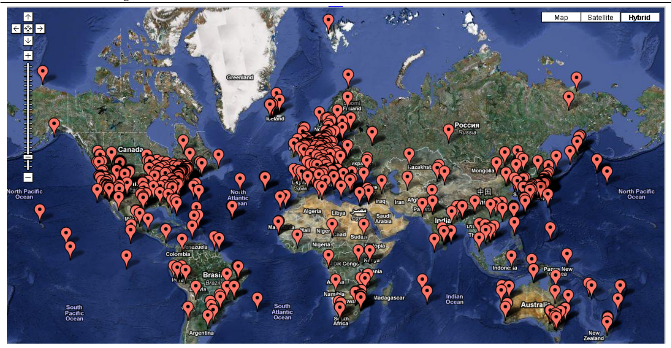
Figure 2 . MCI scores are implemented in the GOLD database. MCI scores can be seen on the GOLDCARDS for each entry and are including in the advanced search option. For example, all entries with an MCI score > 50 are shown on the map below.