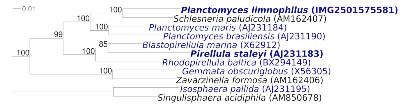
Figure 2. Phylogenetic tree highlighting the position of P. limnophilus Mü 290<sup>T</sup> relative to the type strains of the other species within the genus and to the type strains of the other genera within the family Planctomycetaceae . The tree was inferred from 1,336 aligned characters [27,28] of the 16S rRNA gene sequence under the maximum likelihood criterion [29] and rooted in accordance with the current taxonomy [30]. The branches are scaled in terms of the expected number of substitutions per site. Numbers above branches are support values from 1,000 bootstrap replicates [31] if larger than 60%. Lineages with type strain genome sequencing projects registered in GOLD [32] are shown in blue, published genomes in bold, e.g. the recently published GEBA genome of Pirellula staleyi [33]. 16S rRNA gene sequences are not available for strains of the species P. bekefii , P. guttaeformis or P. stranskae , all of which are typified by descriptions and were initially described as fungi [1,7]. The name P. gracilis was also initially described as a fungus, but the name has not been validly published under the Bacteriological Code. Starr et al. [34] considered this organism not be to a planctomycete.

Figure 2 shows the phylogenetic neighborhood of P. limnophilus Mü 290<sup>T</sup> in a 16S rRNA based tree. The sequences of the two identical 16S rRNA gene copies differ by one nucleotide from the previously published 16S rRNA sequence (X62911) generated from IFAM 1008, which contains one ambiguous base call.